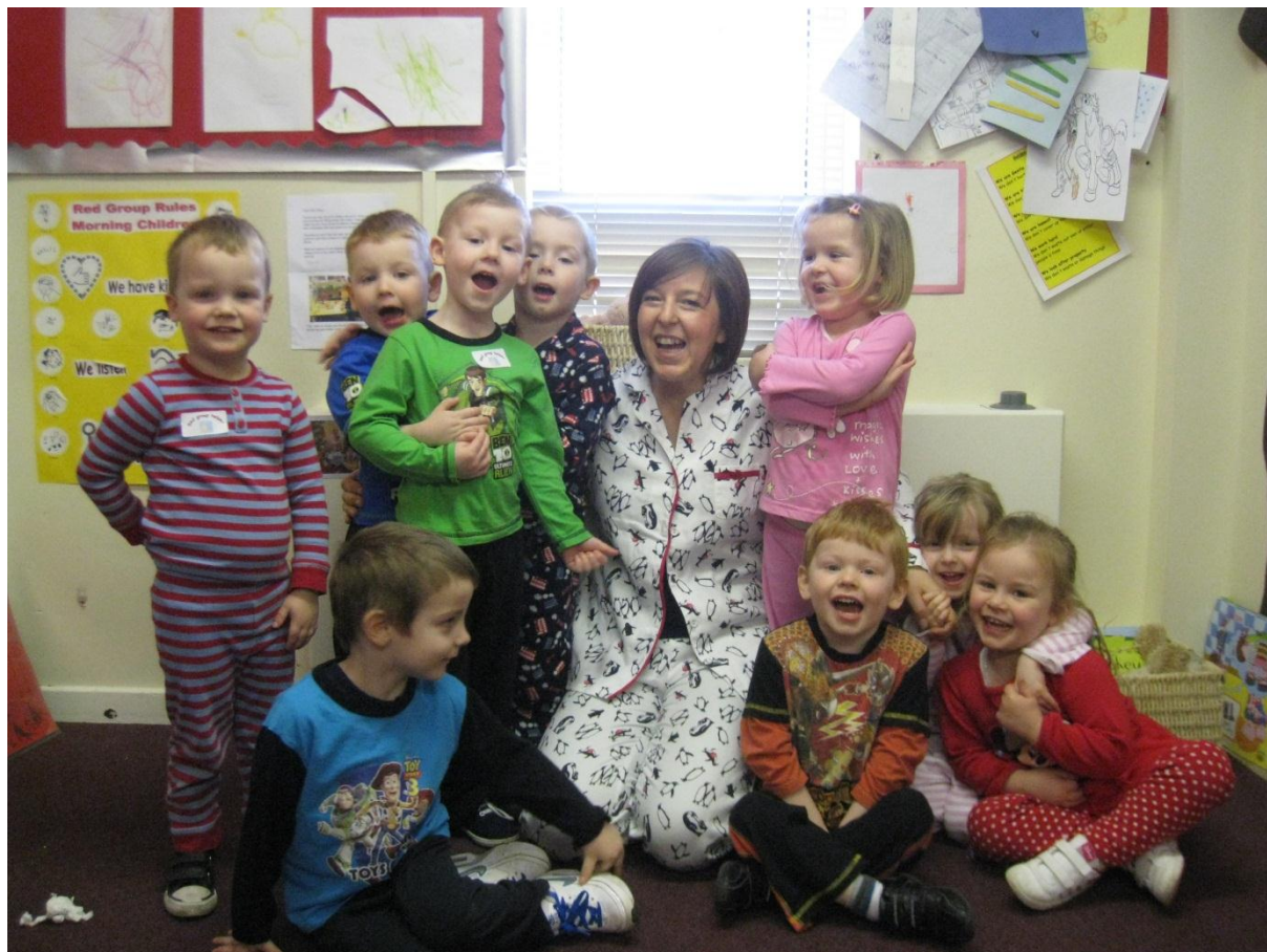
Fun on Red Nose Day (Comic Relief)

If any of the items within this document require further clarification or you have unresolved questions, please do not hesitate to contact the Nursery School.