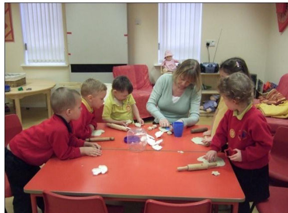
Children enjoying after lunch supervised activities